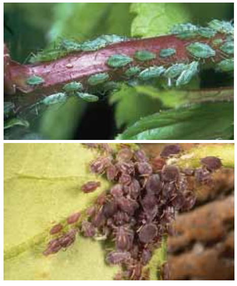
Above: The dreaded greenfly and the equally dreaded blackfly.

Where an aphid infestation is small it's often best to simply squash them with your fingers. For more serious infestations, pinch-out the affected growth or remove the whole plant. In the case of broad beans, early sowing can make them less susceptible to black bean aphids.