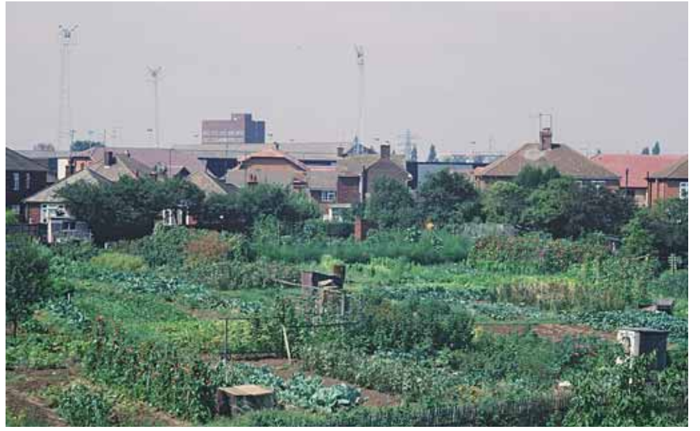
Allotments are a refuge for both people and wildlife. 14,730

Allotments have been around for a long time. They were originally created for poor agricultural workers to compensate them for the loss of common land during the enclosures of the eighteenth century. Allotments proved a good way of alleviating