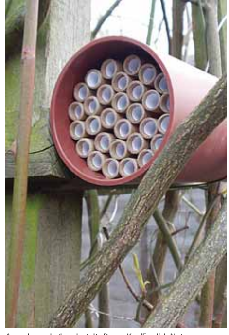
A ready-made 'bug hotel'.

plastic bottle and stuff it full of lengths of bamboo or rolled-up corrugated cardboard. Hung in a quiet spot these bottles will be useful refuges. Short lengths of old hosepipe – folded double and hung in a tree or bush – will also attract tenants.