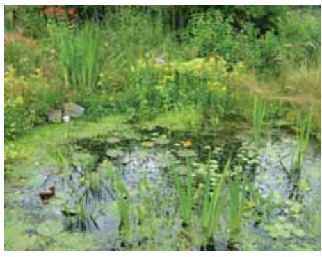
Do you have room for a pond?

(see 'Habitats, nesting sites and refuges'). Many beneficial creatures will use a pond as a watering hole, and digging a wildlife pond will boost the local frog population, these amphibians being some of the best slug predators there are. Unless you have a very large plot it's unlikely you'll be able to sacrifice the space for a substantial pond, but within the wider allotment area there might be a suitable patch of land that is lying unused.