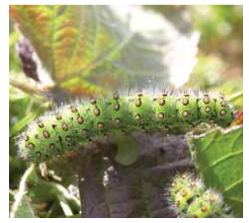
An emperor moth caterpiller Pavonia pavonia on bramble.

The same is true of many other vigorous plants (Russian comfrey, for example) that will take over a plot if they are not controlled. You should take particular care to control pernicious weeds such as couch grass to make sure they don't cause a problem for other plot-holders.