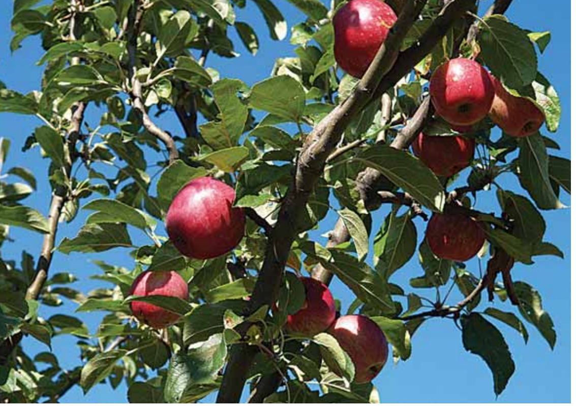
Orchards can be superb wildlife habitats.

include apples, pears, cherries, plums, quinces, damsons, gages and cobnuts. Why not plant a range of traditional varieties? Many 'old English' varieties have become very scarce and you could do your bit to help preserve them (see also 'Heritage seeds').