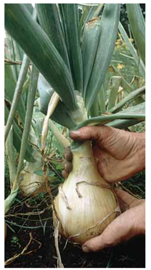
Know your onions! Organic wildlife-friendly gardening can produce great results.

Why not introduce a few heritage vegetables to your plot? Apart from the fun of trying something different, the interplanting of heritage and hybrid varieties of the same crop could have advantages (see 'Companion planting').