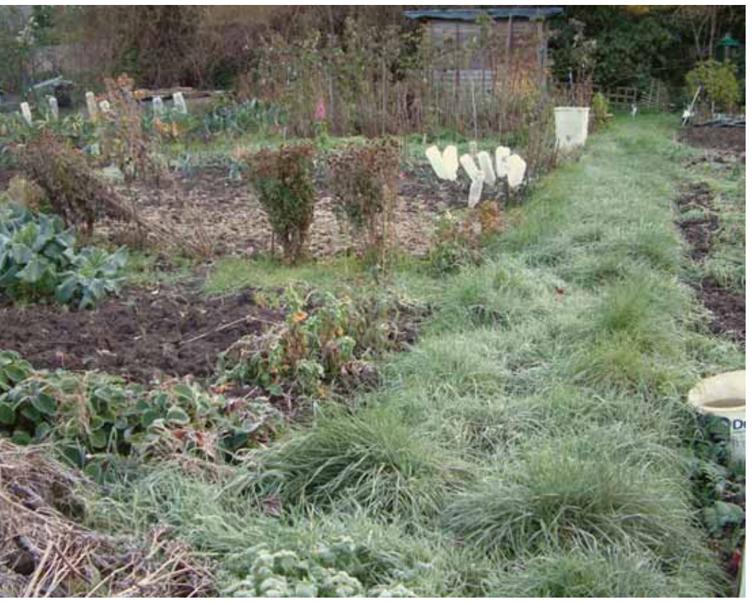
Broad grassy strips make excellent refuges and breeding sites for predatory beetles.

Large-scale beetle banks are often seen on organic farms where field margins and mid-field strips are deliberately left unploughed. Some allotment holders subdivide their plots into separate beds using grass strips, and beetles will benefit if you broaden these as far as practical and let the grass grow long.