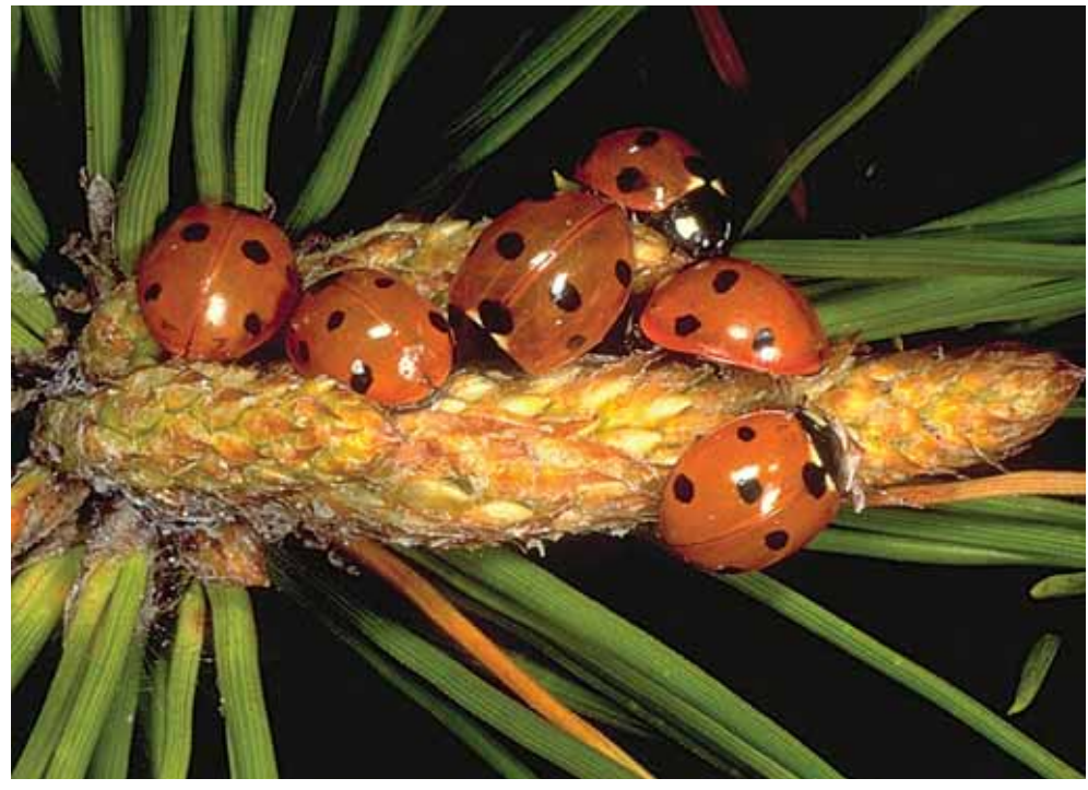
A valuable ally, the seven-spot ladybird Coccinella septempunctata.

However, once you've encouraged some of nature's helpers to live on your plot you can't expect them to do all the work! A healthy population of predators on your allotment will help subdue a host of pests, but sometimes even they will be overwhelmed. In these cases you may have to step in to remove infested growth or even whole plants.