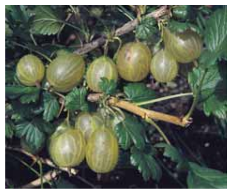
Expose pests by growing gooseberry plants as a cordon or fan.

Try to grow the plants as a cordon or fan. This makes infestations more obvious enabling you to remove affected leaves. Remove mulches in the autumn as these will harbour grubs. (See also 'Winter digging'.)