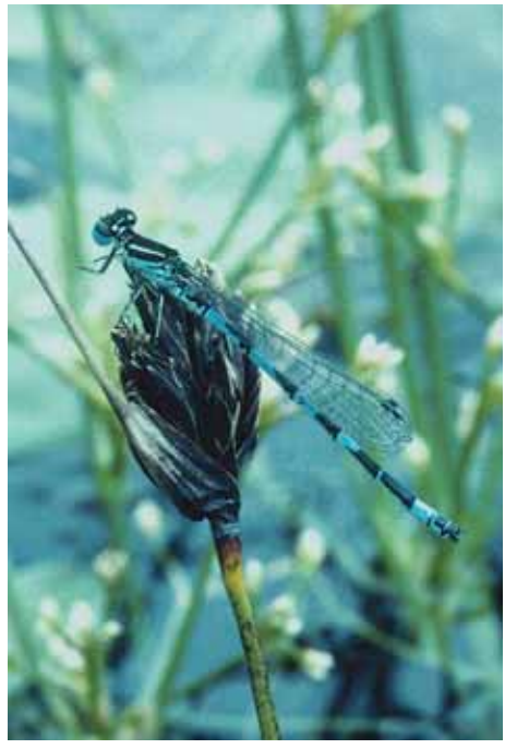
A pond will attract many kinds of predator, such as this southern damselfly Coenagrion mercuriale.