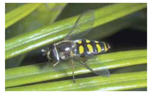
A hoverfly Metasyrphus luniger.

A single ladybird can eat 100 aphids a day and they will also consume whitefly, potato beetle, bean beetle and mealy bugs, amongst others.