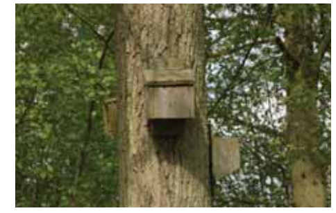
Bats need boxes too!