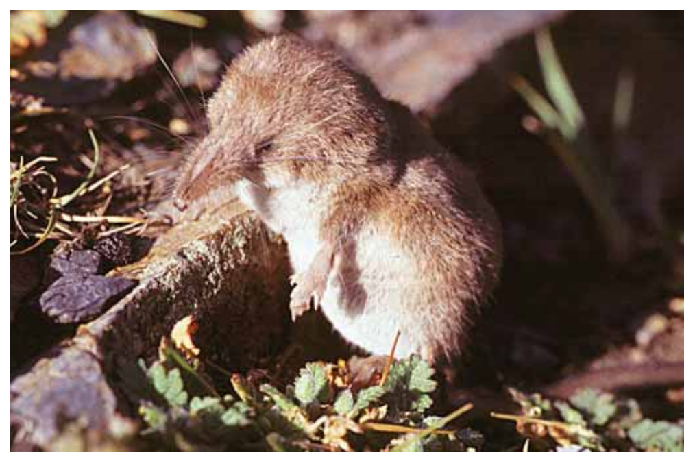
A pygmy shrew Sorex minutus on the look out for its next meal.

baited with chunks of carrot, apple or potato, then release them at least 2 km away; but it's probably easier to protect seed beds with wire mesh laid on the soil. Alternatively, avoid autumn or early spring sowings (when mice will be at their hungriest) or raise pea and bean seedlings in pots.