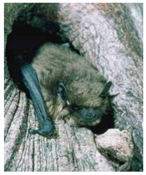
A single pipistrelle bat can catch over 3,000 flying insects in a night.

Bats are superb insect predators. A single pipistrelle (the smallest of our bats) can catch over 3,000 flying insects in a night. Bat boxes are no harder to make than bird boxes but have to be built and positioned differently and must always be made from untreated timber. For more information, contact the Bat Conservation Trust, or read the English Nature leaflet Focus on bats (see 'Contacts and further information').