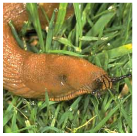
Arion rufus, the red slug.