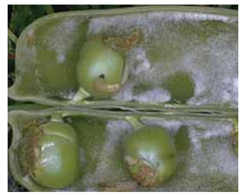
The pea moth caterpillar Cydia nigricana .

This lays its eggs inside pea flowers so early and late sowings may avoid the times the moth is in flight. Alternatively, cover the flowers in a fine mesh. (See also 'Winter digging'.)