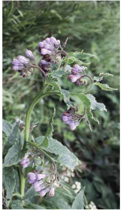
Comfrey makes an excellent liquid manure.

done with nettles using 1 kg of leaves for every 10 litres of water. After two weeks the resulting fluid is diluted by adding 10 parts water to 1 part nettle liquid.