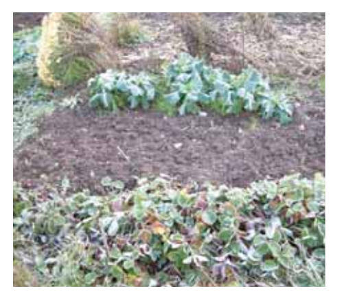
Winter digging exposes pest larvae to predators and the cold.

However, there is a down-side; the grubs of many beneficial beetles will also be unearthed by digging so try to limit cultivation to a single session and leave some areas undisturbed. (See 'Habitats – beetle banks'.)