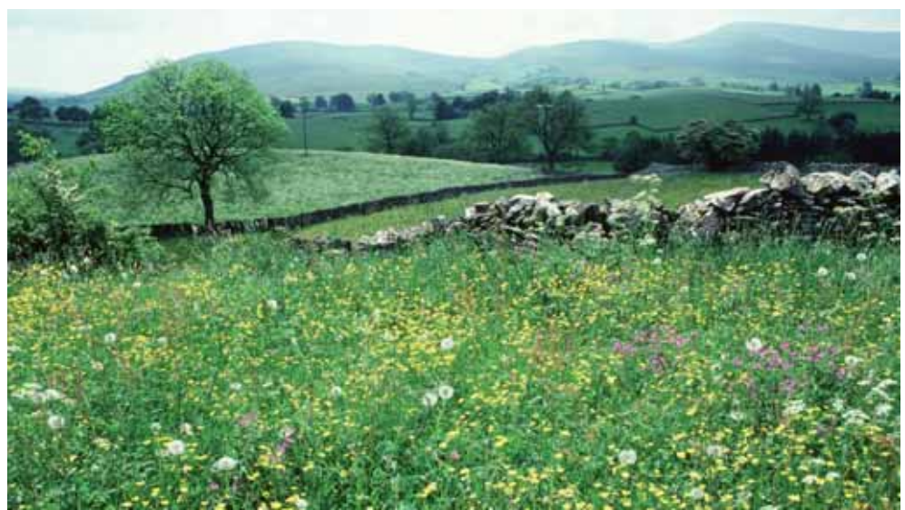
Diverse, wildlife-friendly farmland is under threat from intensive agriculture. Peter Wakely/English Nature 7928

rural poverty and their creation became official government policy in 1845. By 1873 there were 242,000 of them, one allotment for every three male agricultural workers in England.