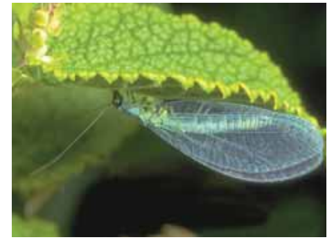
Look after beneficial insects such as the green lacewing Chrysopa carnea.

mites could cope with spraying far better than their predators and thrived as a result.