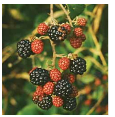
Brambles will provide food and shelter for a wide variety of beneficial wildlife.

Untended plots may be taken over by bramble which is an excellent food source and refuge for many kinds of wildlife. Apart from attracting insects such as hoverflies, bees and lacewings, a tangle of brambles is a favourite nesting site for birds like robins, wrens, song thrushes and blackbirds. Some warblers and finch species may also use bramble in this way. To control bramble, cut different sections back on a three- or four-year rotation so there is always a gradation between first-year growth and mature stems; this means you can keep a plot relatively tidy but still retain much of the wildlife benefit.