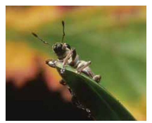
The pea and bean weevil Sitona lineatus.