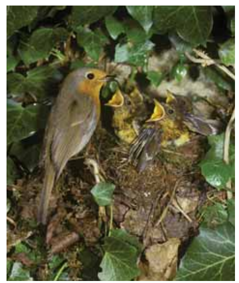
Time hedge pruning to avoid the nesting season.

If there is a hedge on your allotment, prune it in late winter after the berries have gone, but before the start of the nesting season as it is illegal to disturb nesting birds. The end of January is a good time. To lessen the impact of pruning, cut back only a third of your hedge in rotation each year. This leaves one third undisturbed for at least two years.