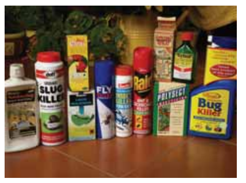
They all work, but they may kill friend as well as foe.

In some cases the use of pesticides has even created pest problems! For example, the fruit tree red spider mite only became a significant pest in the 1930s following the widespread agricultural use of tar-oil sprays – the