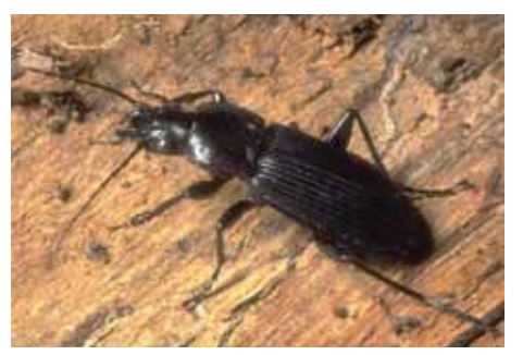
Ground beetles like Pterostichus niger will appreciate undisturbed ground.