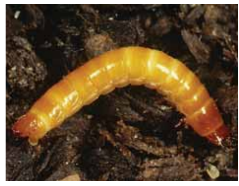
A wire worm Athous haemorrhoidalis.

These are the larvae of click beetles. They live in the soil and will attack many crops including potatoes, strawberries, brassicas, beans, beetroot, carrot, lettuce, onion and