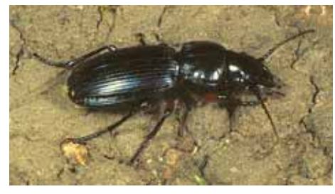
A ground beetle Pterostichus madidus .

These are often shiny black or metallic in colour with obvious grooves down the wing-cases. They are voracious predators of slugs and other pests. (See 'Habitats – Beetle banks'.)