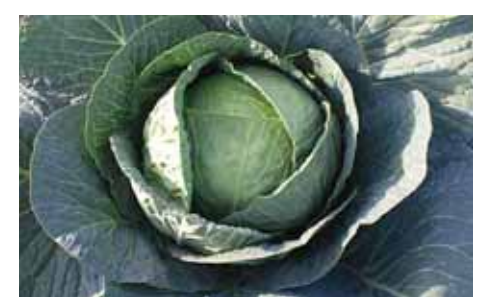
Cabbages and beans seem to make good planting partners. Mr Fothergill's

There is anecdotal evidence that where cabbages are grown with unrelated plants like runner beans, there's a reduced incidence of cabbage aphid and cabbage root fly. It's thought these insects will land on a selection of plants to make sure there is a sufficient density of cabbages to support their offspring. The theory is that, after landing on one or two cabbages, they will get discouraged and fly away if the second or third plant they land on is a bean, or some other non-cabbage.