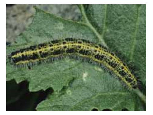
Above: A large white cabbage butterfly caterpillar Pieris brassicae.

Two species of butterfly, large whites and small whites, are often lumped together as 'cabbage whites' (the closely related green-veined white is not a pest species). Squash their oval, yellow eggs when you find them and exclude the adults with a fine mesh netting.