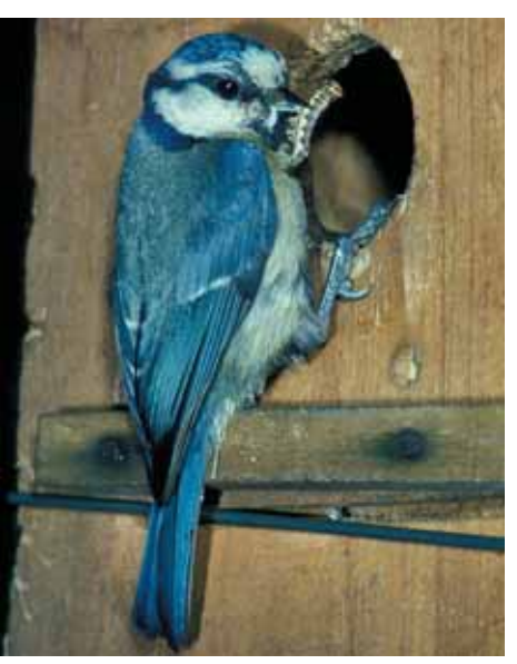
Blue tit chicks have a big appetite.

The best ways to encourage beneficial birds onto your plot are to put up bird boxes and provide drinking water. For detailed advice on building and positioning bird boxes get in touch with the British Trust for Ornithology (BTO) or the RSPB (see 'Contacts and further information'). Most plots should be able to accommodate a small nesting box, but perhaps the wider allotment area provides opportunities for a more ambitious housing project? For example, is there a site that could accommodate a box for owls? A family of these night-hunters on the premises would certainly discomfort the local rodent population!