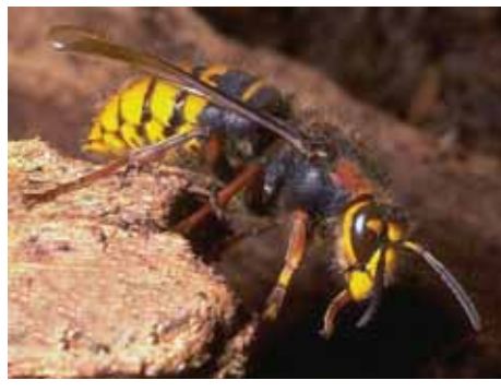
The French wasp Dolichovespula media is now common in many gardens.

The adults are not carnivorous but most hoverfly larvae are ravenous hunters. Each consumes around 900 aphids in its short life, together with