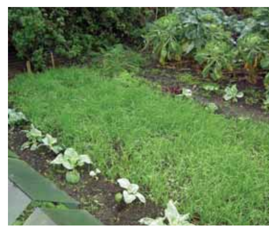
A fallow bed sown with Italian rye-grass Lolium multiflorum.

If you let green manures flower, it is important to cut them down before they set seed. The cut plants can be left on the soil as a mulch, dug into the ground, or added to the compost heap.