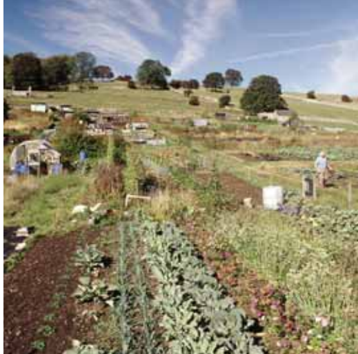
Top: An urban oasis. Bottom: Fresh food and fresh air.