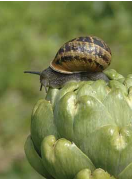
Snails like artichokes too.