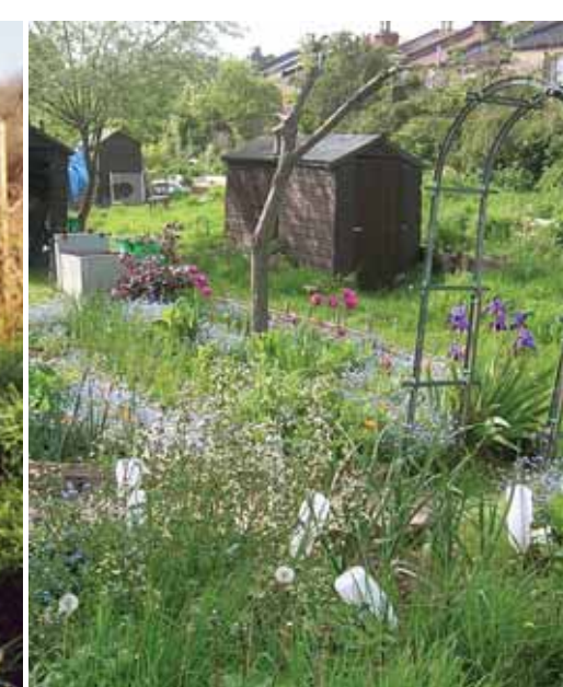
Left: The next generation will need allotments too. Right: An urban allotment.

means getting together with at least five other local people (registered on the electoral roll) and approaching the authority as a group.