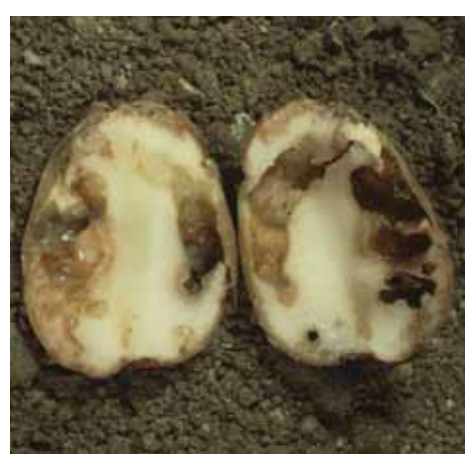
Potatoes damaged by slugs.

These also attack tayberry, blackberry and loganberry. Remove mulches in the autumn to expose the grubs to predators and gently dig the soil to do the same. After fruiting, remove netting to allow birds to hunt down adults and larvae. Cutting the canes to the base at the end of the year can also help.