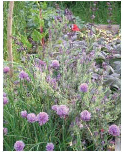
Strong-smelling herbs may distract or repel pest species.

nematode repellent so, in theory, they could help repel potato cyst eelworms. An added advantage of planting flowers like marigolds is their bright blooms which help attract beneficial insects such as hoverflies and bees. Strong-smelling French marigolds are also said to repel whitefly. Other useful companions are legumes, such as lupins, that fix nitrogen with their roots for the benefit of adjacent crops. It seems that companion plants can even be from the same species. Research has shown that nonresistant cultivars can benefit when inter-planted with disease-resistant varieties of the same crop. The theory is that resistant rows act as barriers, blocking the path of pests and diseases that might otherwise pass easily from plant to plant.