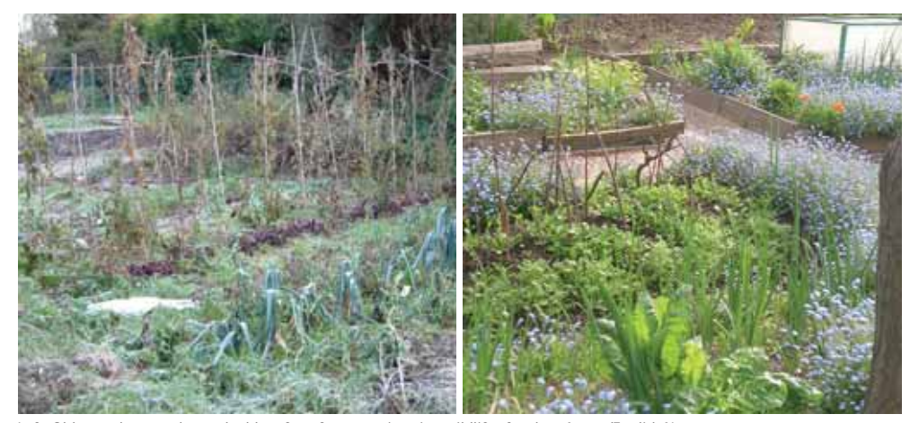
Left: Old growth can make a valuable refuge for over-wintering wildlife. Right: A display of flowers will draw many beneficial creatures to your plot.