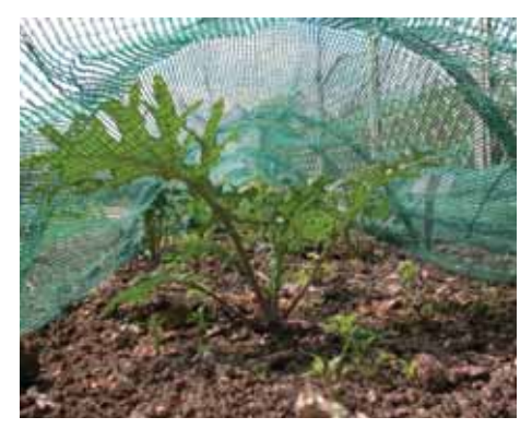
Netting will exclude a wide variety of pests. Garden Organic