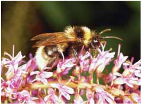
The small garden bumblebee Bombus hortorum .

There are around twenty bumblebee species in the UK and they are excellent pollinators. Unlike honey bees, bumblebee colonies die in the winter and only the young queens survive, hibernating through the cold weather to emerge in the spring and look for new nest sites. Some of the insect refuges described here will benefit hibernating queens and they will find overgrown, undisturbed areas ideal nesting places; they particularly like old mouse and vole nests in tussocks or under sheds etc.