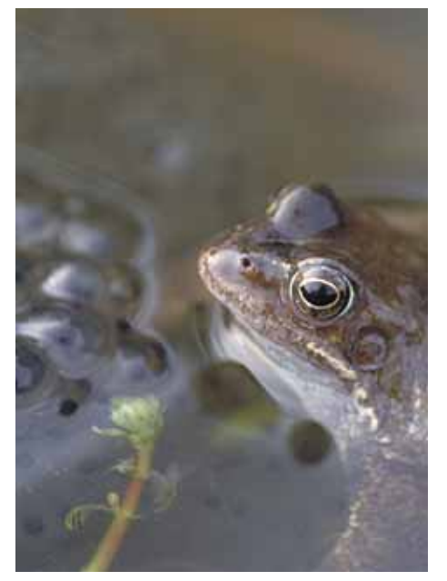
A prime slug predator, the common frog Rana temporaria.

Before creating a pond you must obtain the permission of your allotment authority. Ponds can be a hazard, especially where young children are concerned.