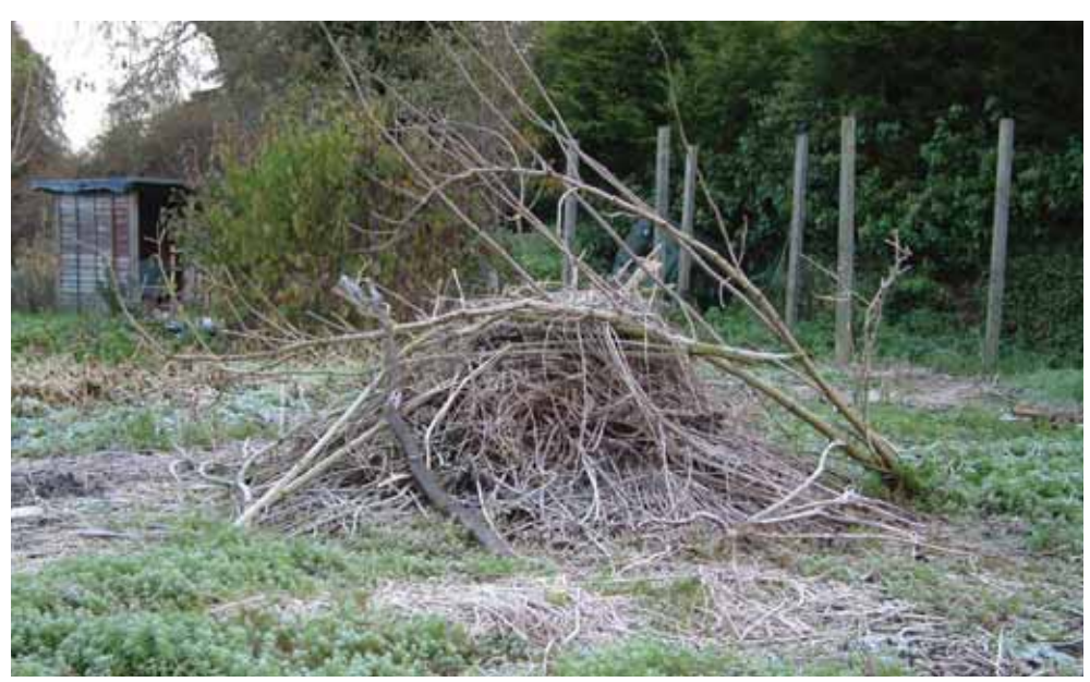
A bonfire pile can be a valuable winter refuge.

Heaps and compost bins are the ideal way to dispose of organic allotment waste and the compost they produce is an excellent soil improver. Under the right conditions organic waste can be composted in as little as two