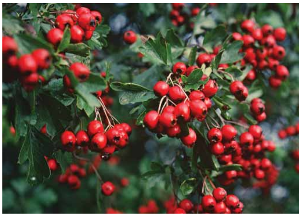
Hawthorn is one of the most valuable hedging plants.

Remember to consult your allotment authority if you plan to replant an old hedge or start a new one.