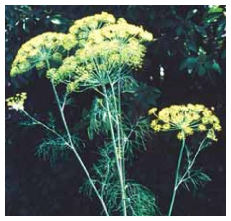
Plants such as dill Anethum graveolens have open umbelliferous flowers that are popular with many insects.

native flowers or herbs on your plot will make an attractive feature and be an invaluable resource for many beneficial creatures.